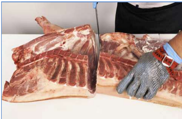
2 The middle is removed from the forequarter between the 4th and 5th rib.