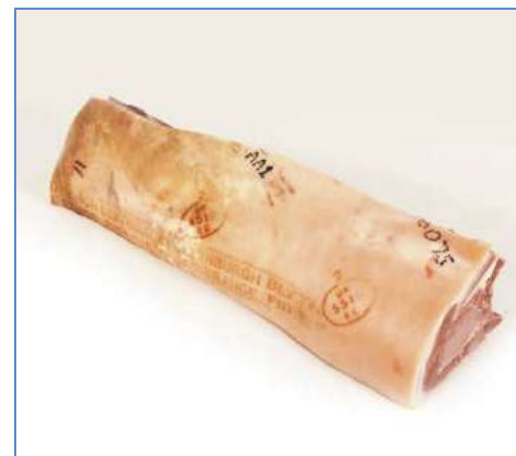
7 Loin – bone-in, rind on, including fillet.