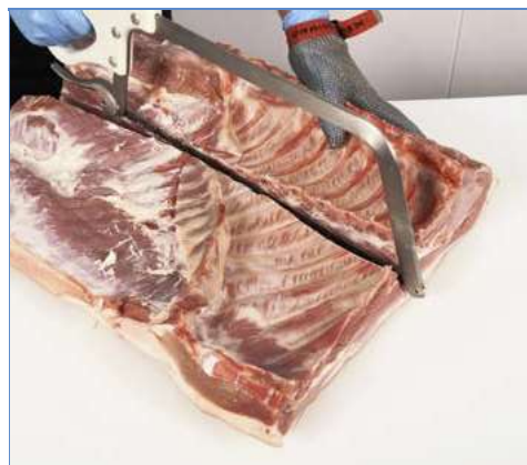
5 ... and by following the back line of the carcass towards the lumbar section of the loin.