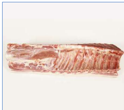
6 Loin – bone-in, rind on, including fillet.