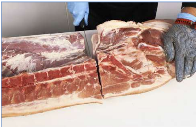
1 The leg and chump is removed between the 5th and 6th (last two) lumbar vertebrae