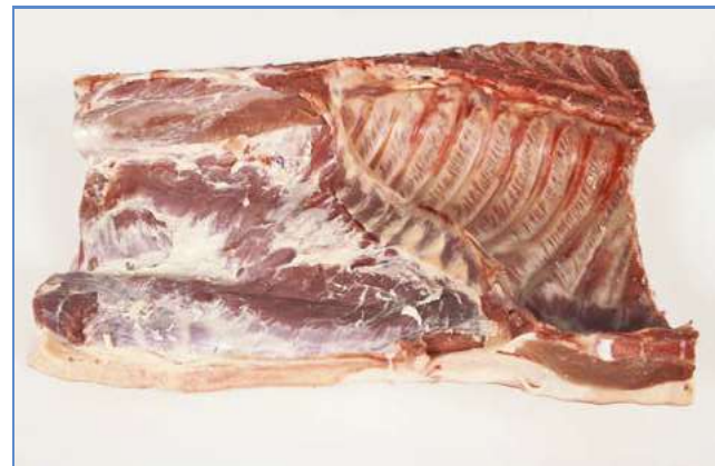
3 Middle of pork.