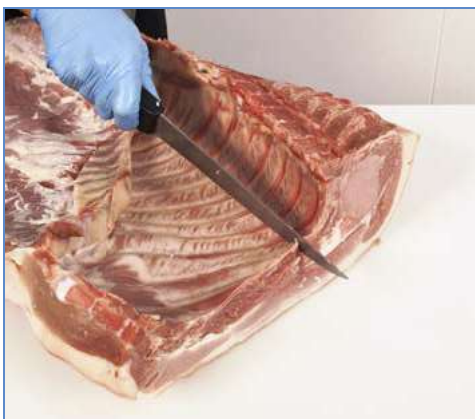
4 The belly is removed from the loin, 50mm from the tip of the eye muscle ...